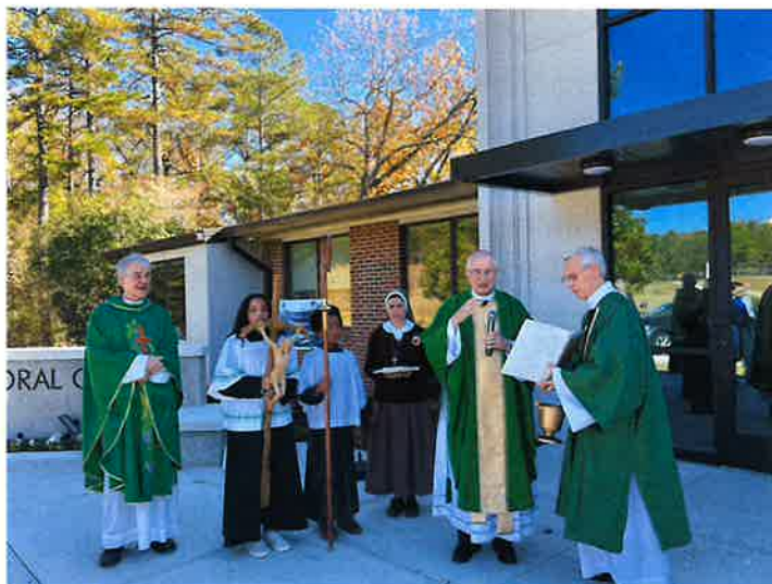
We welcomed Bishop Raica on November 19, 2023, for the dedication and blessing of the new Hayden Pastoral Center.

The following pages give a more detailed report on the State of the Parish from the Finance Council